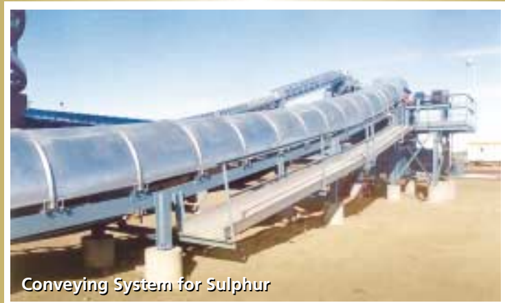
Conveying System for Sulphur