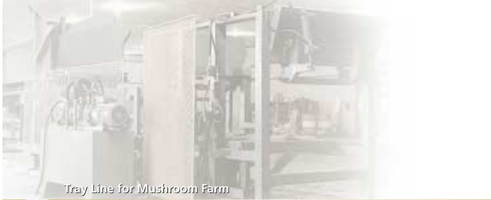
Tray Line for Mushroom Farm