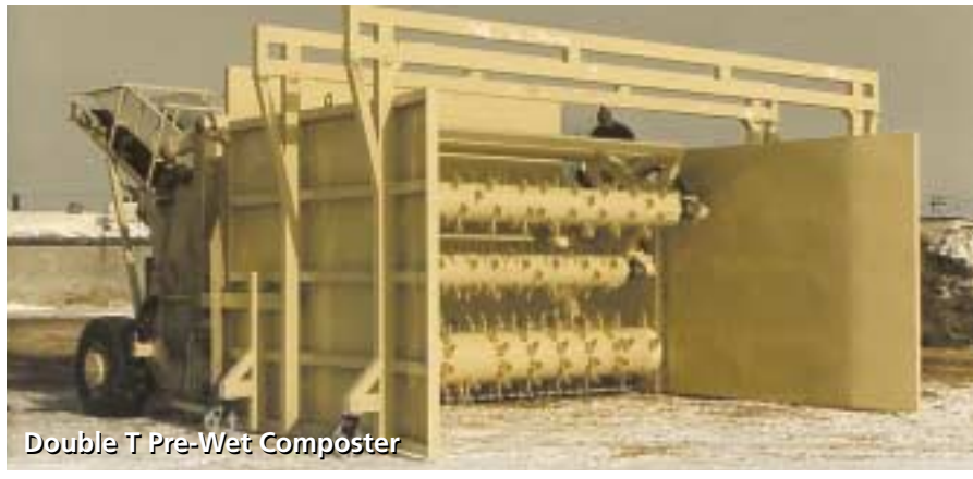
Double T Pre-Wet Composter