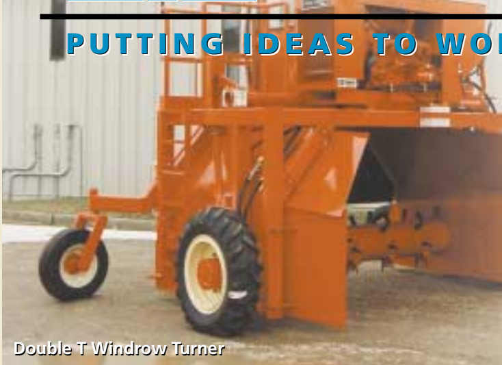
Double T Windrow Turner